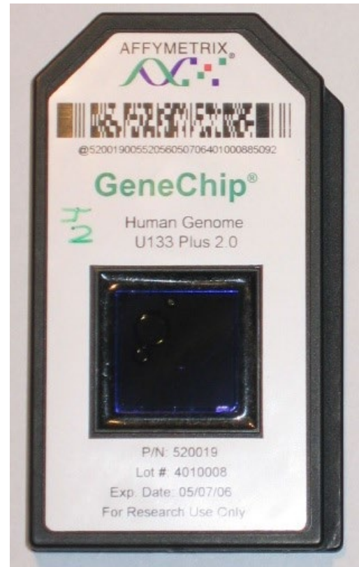
Figure 3: Human genome SNP autosomal DNA test microchip. Depending on the chip, from 600,000 to 1,200,000 locations can be tested. Used under GNU Common License.

GEDmatch was founded by Curtis Rogers and John Olson. The site allowed users from testing companies to upload their DNA results and compare them to the DNA of other users. 34