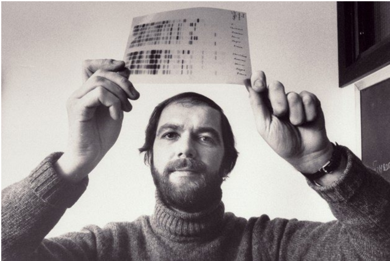
Figure 1: Dr. Alec Jeffreys holding up an electropherogram after his discovery that it can be used for DNA fingerprinting.

At the University of Leicester, English scientist Alec Jeffreys realized that an electropherogram acts as a DNA fingerprint, unique to each individual. 20